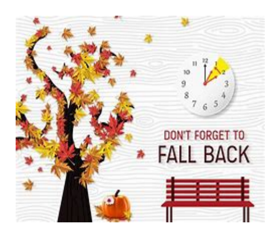
Don't forget the clocks go back an hour on Saturday night.

Meetings for parents will take place over the coming weeks. Notifications will be given through the schools.